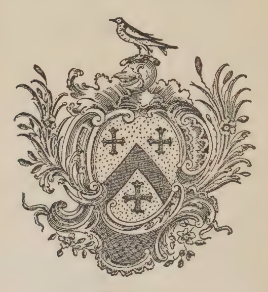
-And let the heralds' officers twist his neck about if they dare.

I have nothing further to add upon him, but that from that time to this, I have borne this poor starling as the crest to my arms.—Thus: